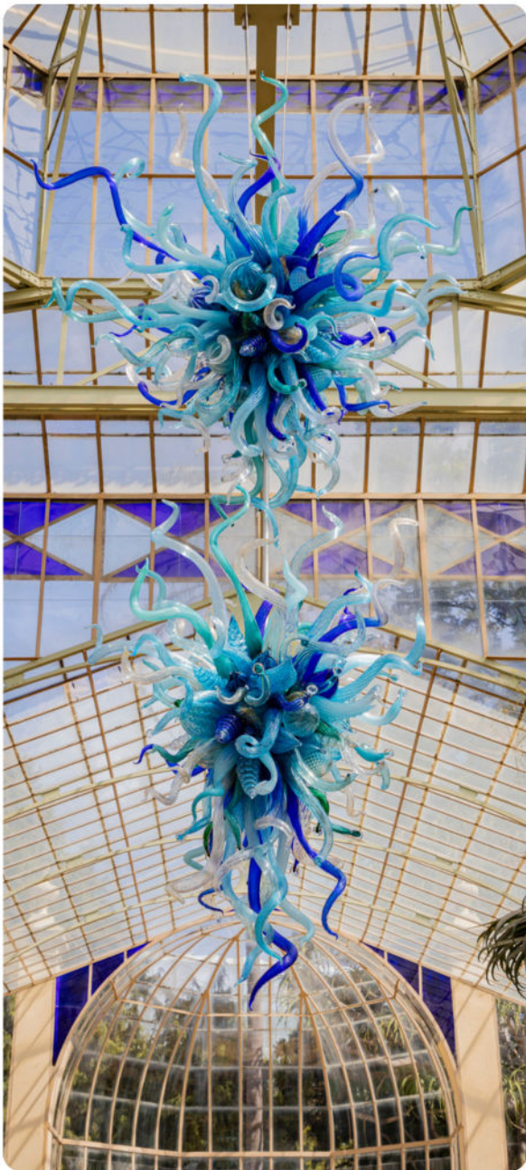
Glacier Ice and Lapis Chandelier, Dale Chihuly, 2024